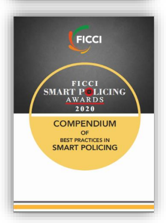
The publications are recognized by the Ministry of Home Affairs and the same have been uploaded on BPR&D website (<a href="http://www.bprd.nic.in">http://www.bprd.nic.in</a>)

The Compendiums could be downloaded by visiting: